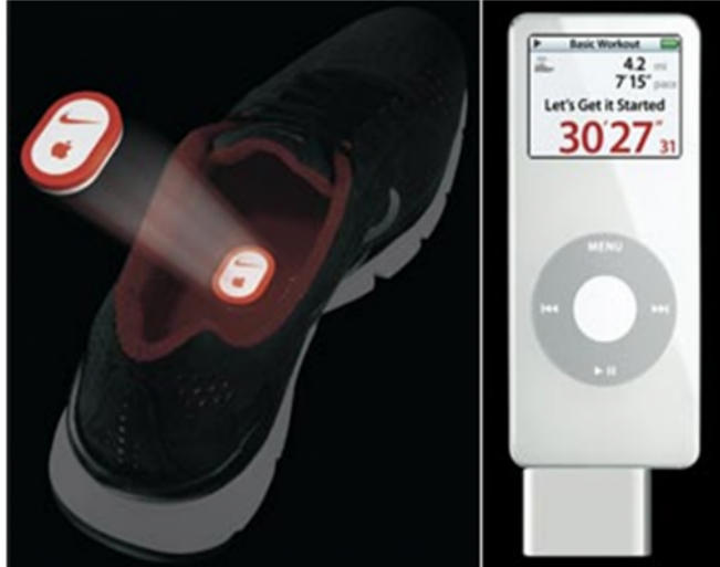
Nike+ iPod System

5. As yet another example, in 2011 and 2012, Nike launched its Nike+ SportWatch and Nike+ FuelBand products. Both were groundbreaking, innovative wearable activity trackers, as shown below.