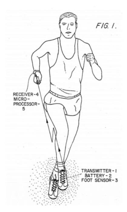
Figure from Nike's 1983 Patent Application

The device, shown in the figure below, included a transmitter and sensor in a runner's shoe, and a receiver and microprocessor remote from the runner's shoe. The sensor gathered activity-related data, the transmitter sent the data to the receiver, the receiver fed the data to the microprocessor, and the microprocessor analyzed and displayed the data and analysis to the runner and her community of athletes.