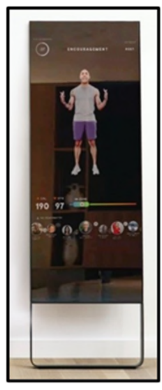
The Mirror Home Gym