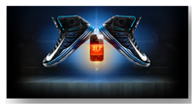
Nike+ ESP Basketball Footwear

7. That same year, Nike also released its Nike+ Kinect product, which was a fitness video game for the Xbox 360. The game encouraged users to be physically active, and allowed users to earn and compete with others with NikeFuel points, which were a unit of measuring athletic performance.